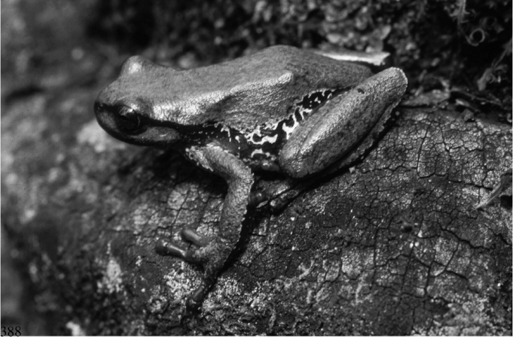
FIG. 1. Female holotype of Plectrohyla miahuatlanensis sp. nov. in life (MZFC 17864).

Weak axillary membrane present; row of low tubercles present on ventrolateral surface of forearm; transverse dermal fold on wrist; fingers long, slender, without lateral fringe, bearing large ovoid discs slightly wider than long; width of disc on third finger nearly twice the diameter of tympanum. Subarticular tubercles on Fingers I–III round, nearly flat, approximately one fourth to one third diameter of discs on respective digits; subarticular tubercles on Finger IV round, elevated, approximately two thirds diameter of disc; supernumerary tubercles low, diffuse; palmar tubercle low, weakly defined; prepollical tubercle moderately short, elongate. Webbing on hands vestigial. Hind limbs moderately slender; tibia length 53% SVL; foot length; 49% SVL; tibiotarsal articulation extending to anterior edge of orbit; heels of adpressed limbs overlap by about 30% length of shank; tarsal fold distinct, extending entire length of tarsus; inner metatarsal tubercle moderately small, flat, ovoid; outer metatarsal tubercle subconical, barely evident. Toes long, slender, with narrow lateral fringe, bearing discs slightly smaller than those on fingers; subarticular tubercles large, some round and moderately flat, others subconical; supernumerary tubercles small, indistinct, in single row on proximal segment of each digit; webbing formula: I1–2III11/4–2III1–21/3IV21/3–11/4V.